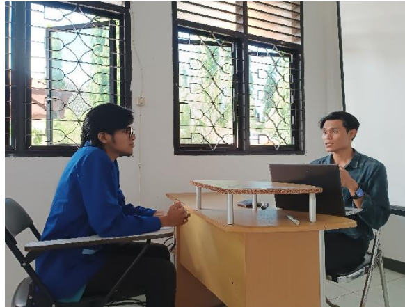
Figure 3. Process of Providing Extrovert S1 Defragmentation for understanding errors

extrovert thinking towards solving mathematical problems. The process of providing defragmentation can be seen in the picture below.