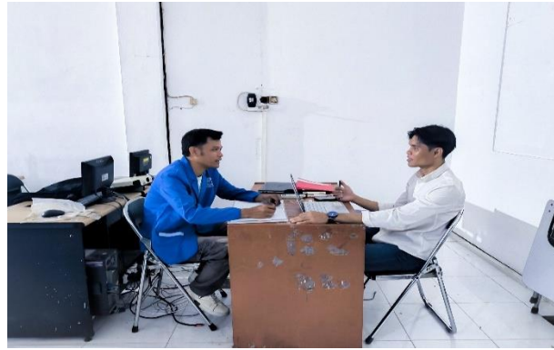
Figure 10. The process of giving introverted S2 defragmentation to transformation errors

The researcher began by providing defragmentation through scaffolding to direct introverted S2 to carry out the evaluation stage in solving mathematical problems by making conclusions or final answers to the solution which can be seen in the results of the introverted S2 answer snippets below.