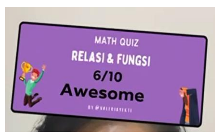
Figure 7. Second Variation of Final Answer Results

The result of validation test by subject matter and language experts showed that the overall assessment percentage for all aspects was 91.81%. Meanwhile, the result of validation test by media experts showed that the overall assessment percentage for all aspects was 88.33%. Moreover, the results of the small group trial showed that the overall assessment percentage for all aspects was 83.96%. This suggests that the Instagram filter-based learning media that has been developed is interpreted as very good.