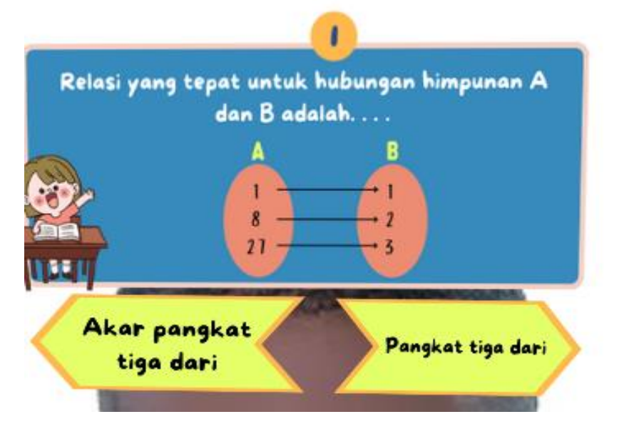
Figure 3. Sample of Relation & Function Question and Answer Options