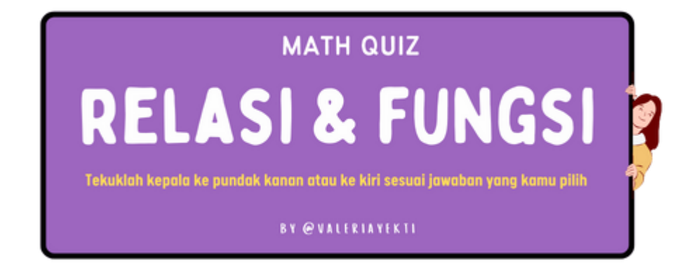
Figure 1. Introduction to the Filter and Use Instruction