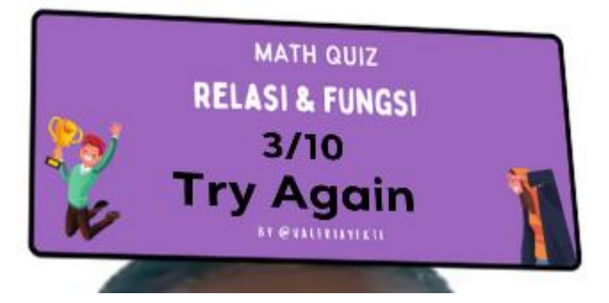
Figure 6. First Variation of Final Answer Results