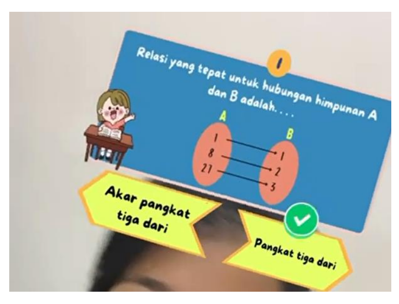
Figure 4. An Example of When the Answer Is Correct